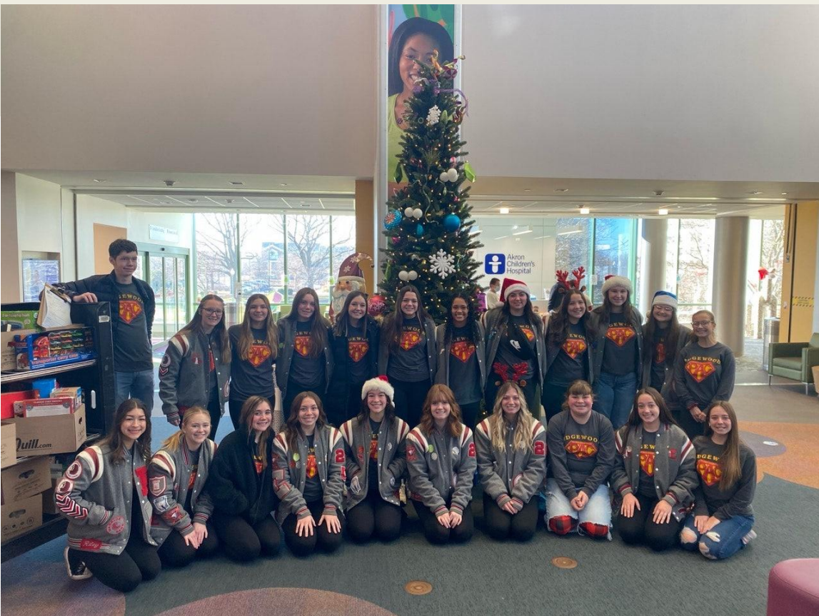
Principal's Advisory at the Akron Children's Hospital after delivering the gifts for all the children that will be staying in the hospital for the holiday.