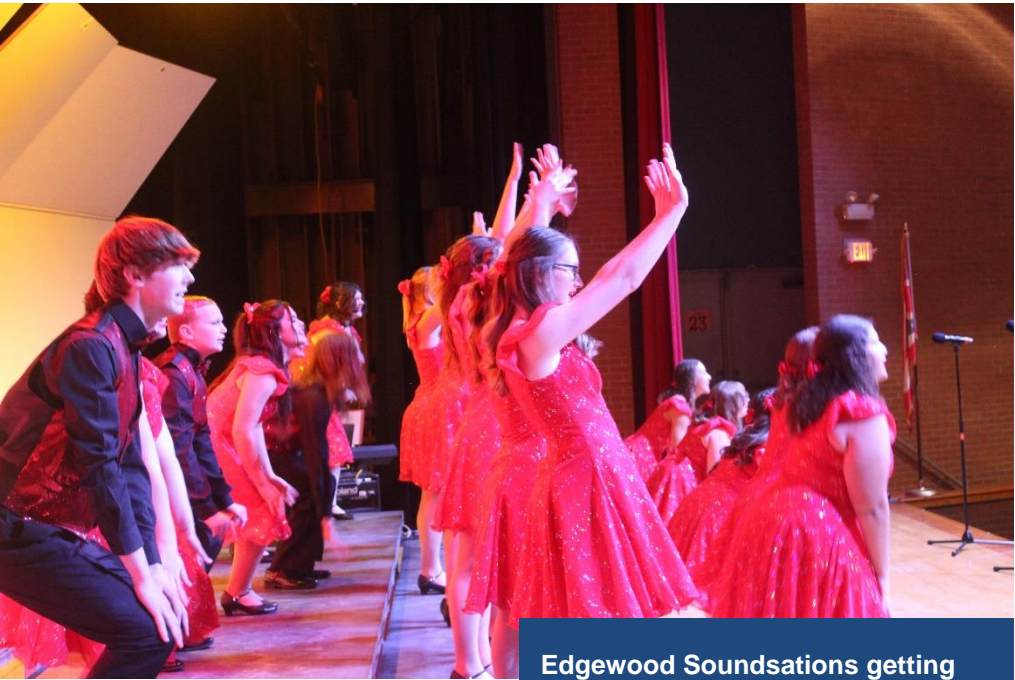
Edgewood Soundsations getting their groove on during Pops, Pizzazz and All That Jazz.