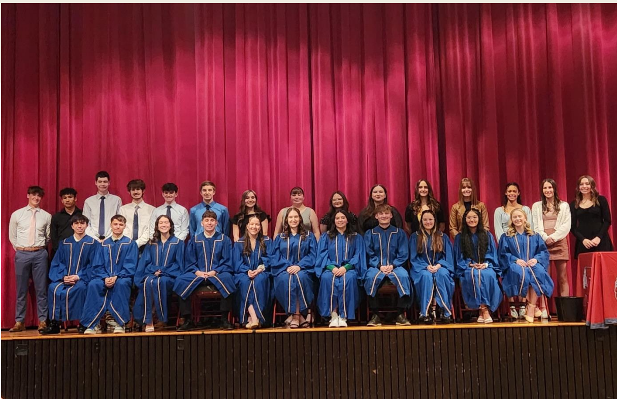
New members are joined by the returning members of NHS. The ceremony took place on November 16, 2023.